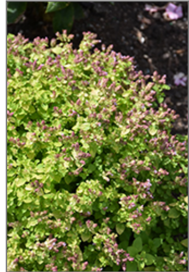
Gilt Trip Oregano flowers