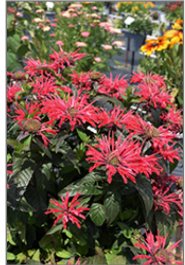
Upscale Red Velvet Beebalm flowers