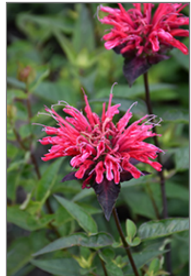
Upscale Red Velvet Beebalm flowers