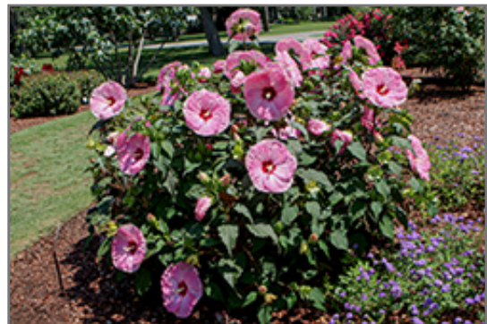
Summerific Spinderella Hibiscus in bloom