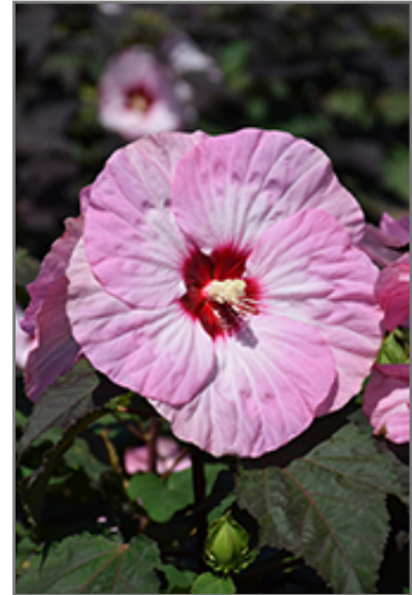
Summerific Spinderella Hibiscus flowers

This plant will require occasional maintenance and upkeep, and is best cleaned up in early spring before it resumes active growth for the season. It is a good choice for attracting butterflies and hummingbirds to your yard. Gardeners should be aware of the following characteristic(s) that may warrant special consideration;