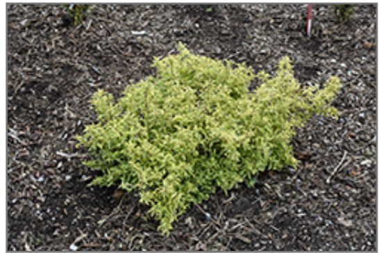
Bubbly Wine Weigela