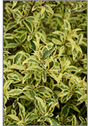
Bubbly Wine Weigela foliage

Bubbly Wine Weigela is recommended for the following landscape applications;