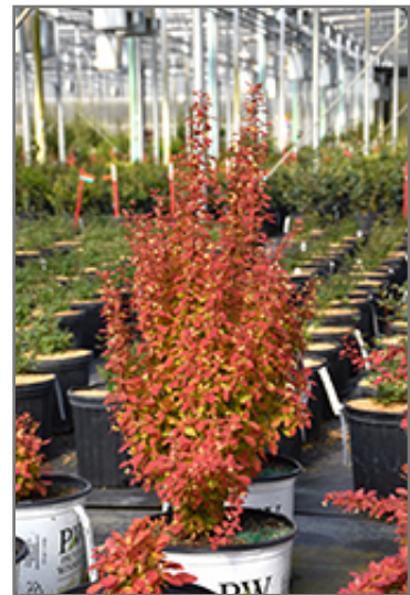
Sunjoy Orange Pillar Japanese Barberry