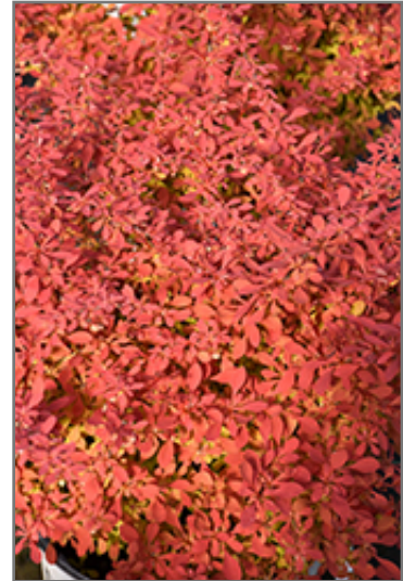
Sunjoy Neo Japanese Barberry foliage

Sunjoy Neo Japanese Barberry is recommended for the following landscape applications;