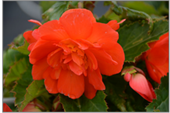
Nonstop Sunset Begonia flowers