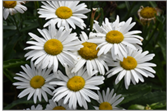
White Lion Shasta Daisy flowers