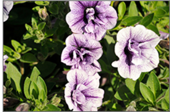
Supertunia Priscilla Petunia flowers