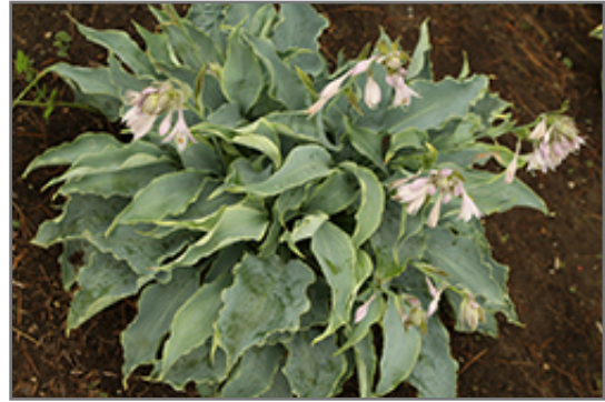
Tears In Heaven Hosta