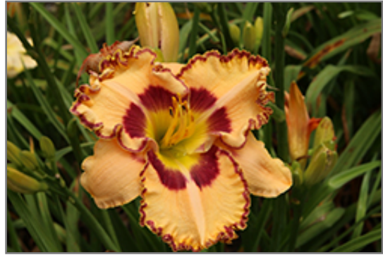
Rainbow Rhythm Lake of Fire Daylily flowers