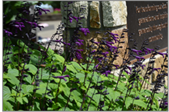
Bodacious Smokey Jazz Sage flowers

Bodacious Smokey Jazz Sage is an herbaceous perennial with an upright spreading habit of growth. Its medium texture blends into the garden, but can always be balanced by a couple of finer or coarser plants for an effective composition.