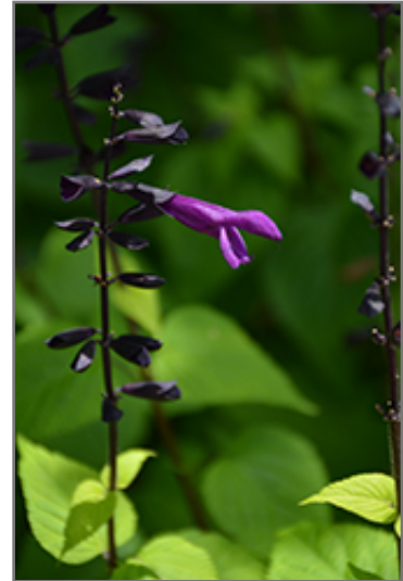
Bodacious Smokey Jazz Sage flowers

This plant is not reliably hardy in our region, and certain restrictions may apply; contact the store for more information.