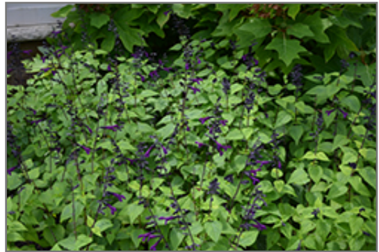
Bodacious Smokey Jazz Sage in bloom