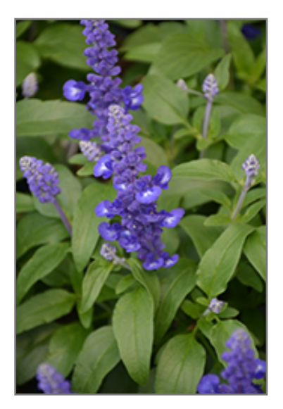
Sallyfun Deep Ocean Salvia flowers

Sallyfun Deep Ocean Salvia is an herbaceous annual with an upright spreading habit of growth. Its medium texture blends into the garden, but can always be balanced by a couple of finer or coarser plants for an effective composition.