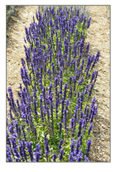
Sallyfun Deep Ocean Salvia in bloom

8785 Green Lake Trail Forest Lake, MN 55025 651-462-5554