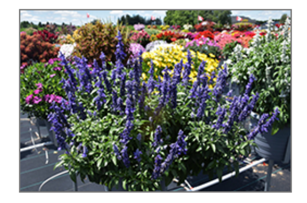
Sallyfun Deep Ocean Salvia in bloom