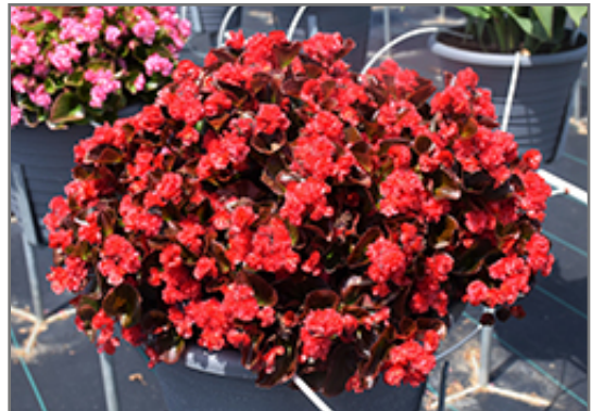
Double Up Red Begonia in bloom