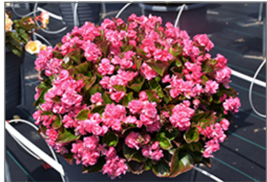
Double Up Pink Begonia in bloom