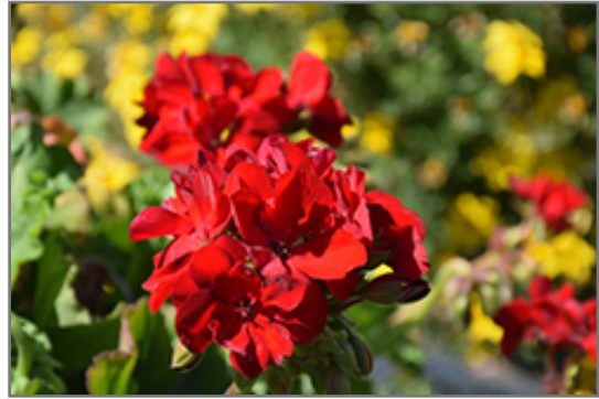
Calliope Large Red Geranium flowers