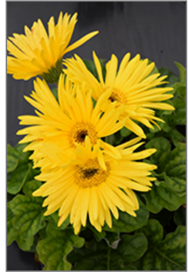
Jaguar Yellow Dark Center Gerbera Daisy flowers

Tidy and compact, the Jaguar series boasts beautiful uniform flowers from spring until fall; bright yellow blooms with dark centers, sit on top of dark green foliage; a great way to add color to borders, containers and fresh cut flower arrangements