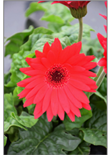
Jaguar Rose Dark Center Gerbera Daisy flowers

Jaguar Rose Dark Center Gerbera Daisy is recommended for the following landscape applications;