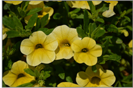
Calitastic Gold Calibrachoa flowers

Calitastic Gold Calibrachoa is recommended for the following landscape applications;