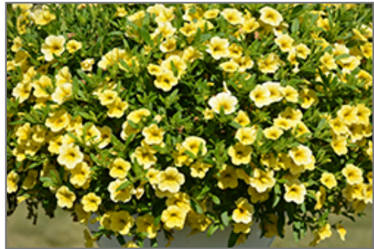
Calitastic Gold Calibrachoa flowers