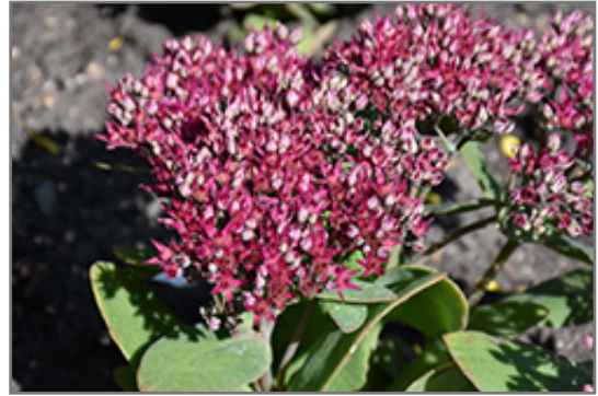
Class Act Stonecrop flowers

Other Names: Autumn Stonecrop, Showy Stonecrop