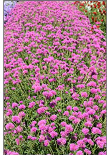
Truffula Pink Gomphrena in bloom

Truffula Pink Gomphrena is a fine choice for the garden, but it is also a good selection for planting in outdoor pots and containers. With its upright habit of growth, it is best suited for use as a 'thriller' in the 'spiller-thriller-filler' container combination; plant it near the center of the pot, surrounded by smaller plants and those that spill over the edges. It is even sizeable enough that it can be grown alone in a suitable container. Note that when growing plants in outdoor containers and baskets, they may require more frequent waterings than they would in the yard or garden.