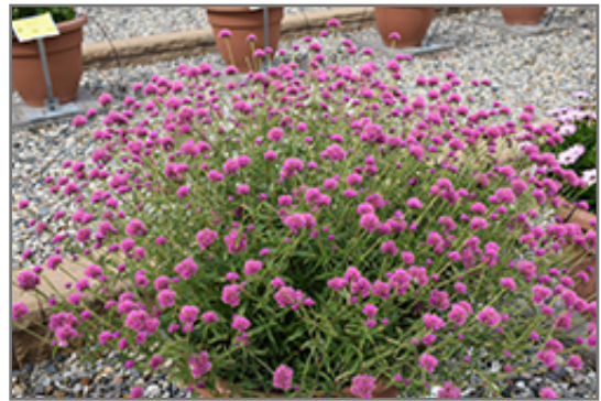
Truffula Pink Gomphrena in bloom