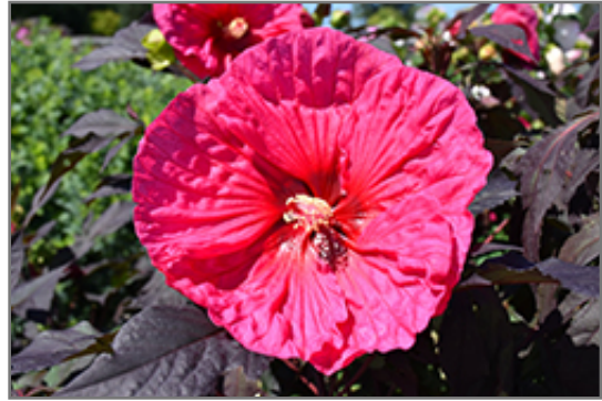
Summerific Evening Rose Hibiscus flowers