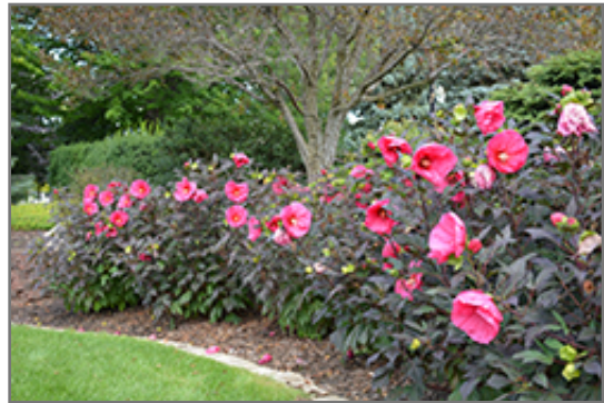
Summerific Evening Rose Hibiscus in bloom