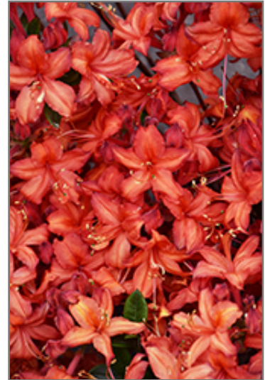
Electric Lights Red Azalea flowers