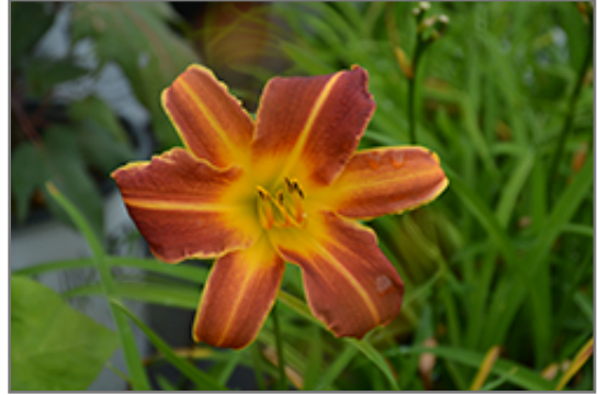
EveryDaylily Red Ribs Daylily flowers