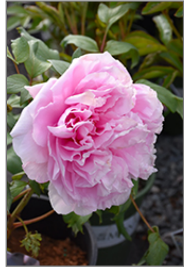
Yachiyo-Tsubaki Tree Peony flowers

Yachiyo-Tsubaki Tree Peony will grow to be about 6 feet tall at maturity, with a spread of 4 feet. It has a low canopy, and is suitable for planting under power lines. It grows at a slow rate, and under ideal conditions can be expected to live for approximately 20 years.