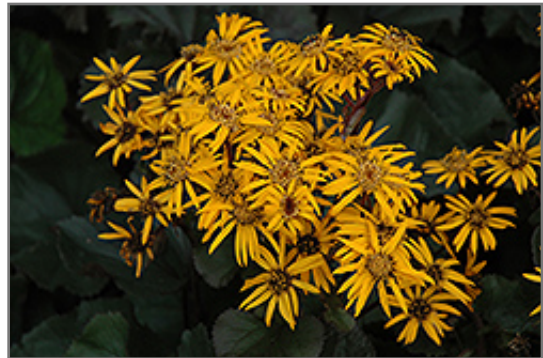
Britt Marie Crawford Rayflower flowers