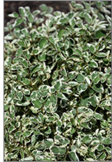
Little Angel Burnet flowers

Little Angel Burnet will grow to be only 4 inches tall at maturity extending to 10 inches tall with the flowers, with a spread of 14 inches. When grown in masses or used as a bedding plant, individual plants should be spaced approximately 12 inches apart. It grows at a medium rate, and under ideal conditions can be expected to live for approximately 15 years. As an herbaceous perennial, this plant will usually die back to the crown each winter, and will regrow from the base each spring. Be careful not to disturb the crown in late winter when it may not be readily seen!