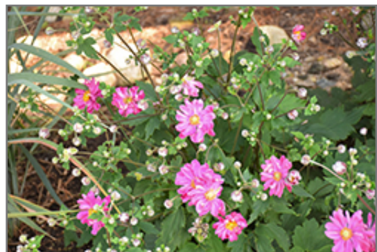
Fall In Love Sweetly Anemone in bloom