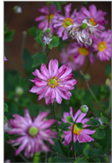
Fall In Love Sweetly Anemone flowers

Fall In Love Sweetly Anemone is recommended for the following landscape applications;