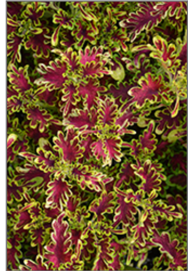
Under The Sea Electric Coral Coleus foliage

Under The Sea Electric Coral Coleus is recommended for the following landscape applications;