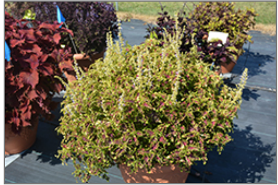
Under The Sea Electric Coral Coleus

Under The Sea Electric Coral Coleus will grow to be about 20 inches tall at maturity, with a spread of 24 inches. When grown in masses or used as a bedding plant, individual plants should be spaced approximately 20 inches apart. Although it's not a true annual, this fast-growing plant can be expected to behave as an annual in our climate if left outdoors over the winter, usually needing replacement the following year. As such, gardeners should take into consideration that it will perform differently than it would in its native habitat.