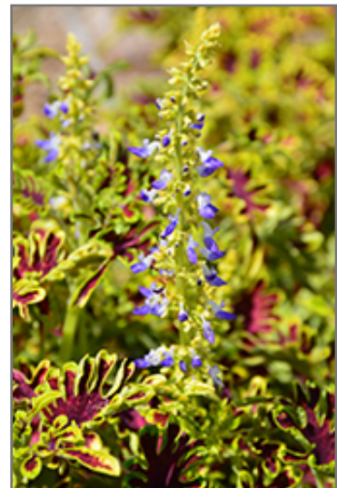
Under The Sea Electric Coral Coleus flowers