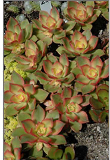
Kiwi Aeonium