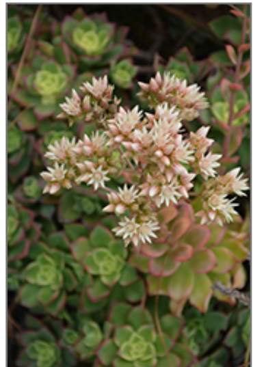
Kiwi Aeonium flowers