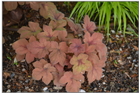
Pumpkin Spice Foamy Bells