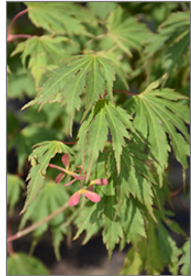
Northern Glow Maple foliage