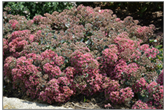
Popstar Stonecrop in bloom