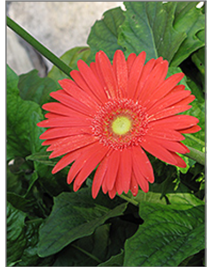
Jaguar Deep Orange Gerbera Daisy flowers