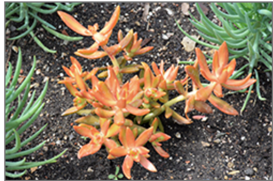
Coppertone Stonecrop