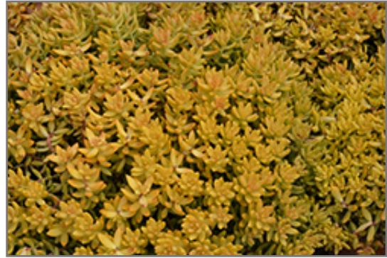
Coppertone Stonecrop foliage

Coppertone Stonecrop is recommended for the following landscape applications;