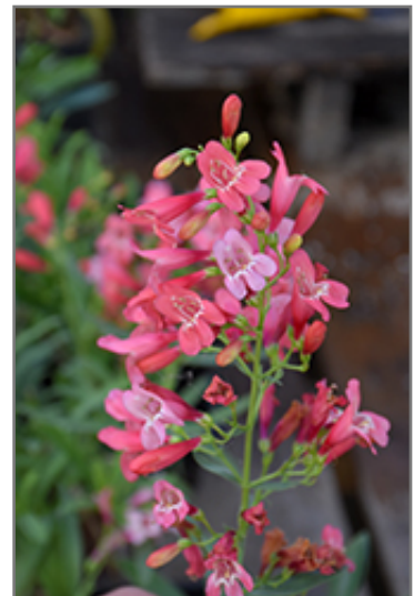
Riding Hood Red Beard Tongue flowers