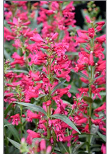
Riding Hood Red Beard Tongue flowers

Riding Hood Red Beard Tongue is recommended for the following landscape applications;