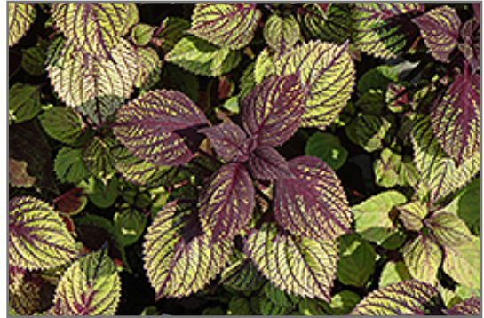
Fishnet Stockings Coleus foliage

Fishnet Stockings Coleus will grow to be about 30 inches tall at maturity, with a spread of 16 inches. When grown in masses or used as a bedding plant, individual plants should be spaced approximately 12 inches apart. Although it's not a true annual, this fast-growing plant can be expected to behave as an annual in our climate if left outdoors over the winter, usually needing replacement the following year. As such, gardeners should take into consideration that it will perform differently than it would in its native habitat.