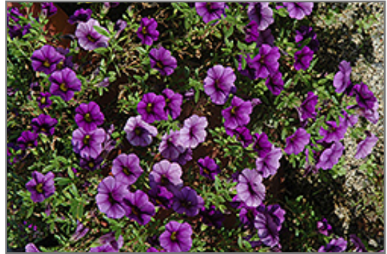
Callie Dark Blue Calibrachoa flowers