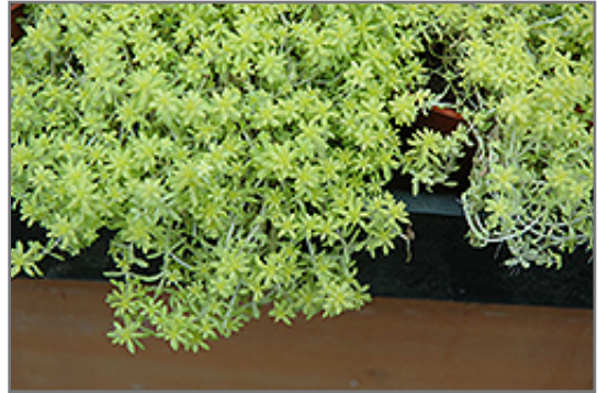
Fine Gold Leaf Stonecrop foliage