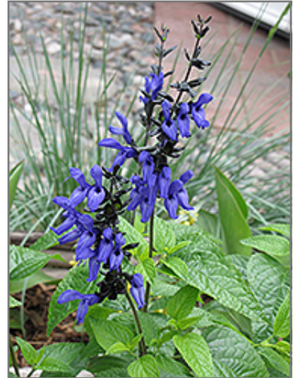
Black And Blue Anise Sage flowers

Black And Blue Anise Sage is an herbaceous annual with an upright spreading habit of growth. Its medium texture blends into the garden, but can always be balanced by a couple of finer or coarser plants for an effective composition.