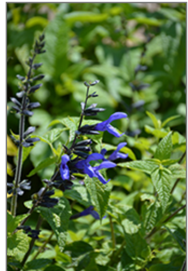
Black And Blue Anise Sage flowers