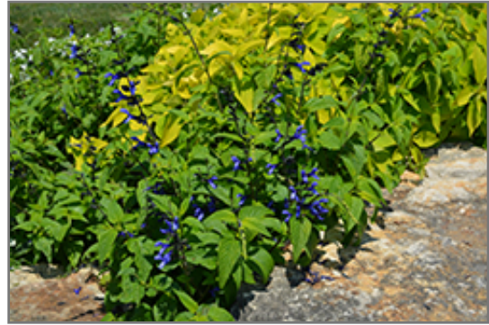
Black And Blue Anise Sage in bloom