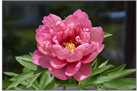
Pink Double Dandy Peony flowers