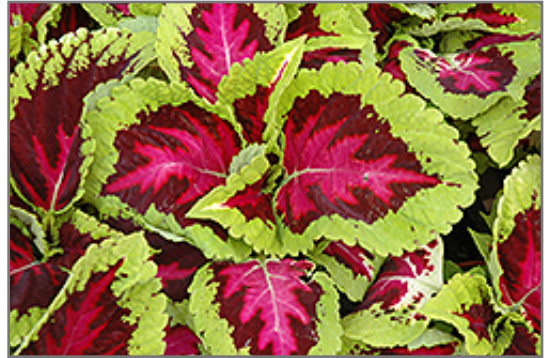
Kong Rose Coleus foliage