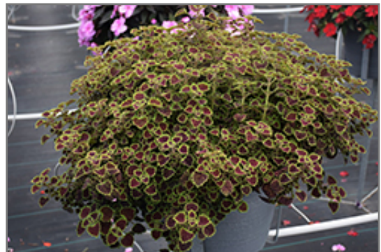
Burgundy Wedding Train Coleus