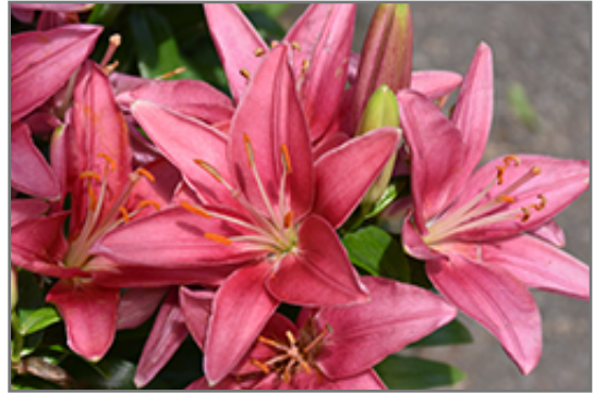
Lily Looks Tiny Pearl Lily flowers