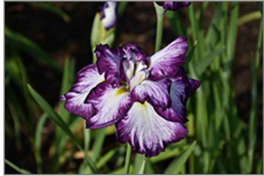
Lion King Japanese Flag Iris flowers

This plant will require occasional maintenance and upkeep, and should be cut back in late fall in preparation for winter. Deer don't particularly care for this plant and will usually leave it alone in favor of tastier treats. Gardeners should be aware of the following characteristic(s) that may warrant special consideration;