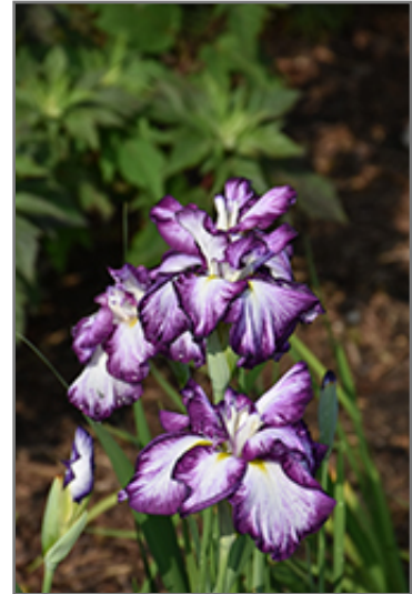
Lion King Japanese Flag Iris flowers