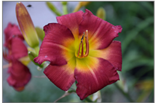
Earlybird Cardinal Daylily flowers