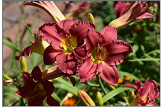
Earlybird Cardinal Daylily flowers