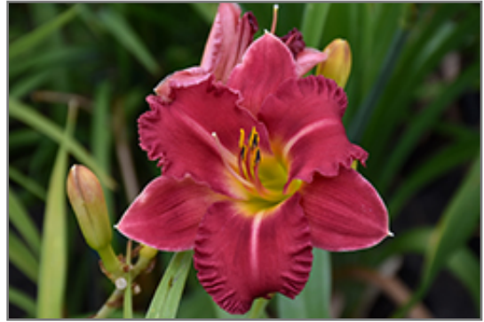
Earlybird Cardinal Daylily flowers

This plant does best in full sun to partial shade. It is very adaptable to both dry and moist locations, and should do just fine under typical garden conditions. It is not particular as to soil type or pH. It is highly tolerant of urban pollution and will even thrive in inner city environments. This particular variety is an interspecific hybrid. It can be propagated by division; however, as a cultivated variety, be aware that it may be subject to certain restrictions or prohibitions on propagation.