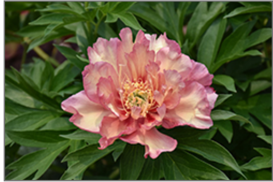
Julia Rose Peony flowers

Julia Rose Peony is recommended for the following landscape applications;