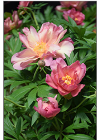
Julia Rose Peony flowers