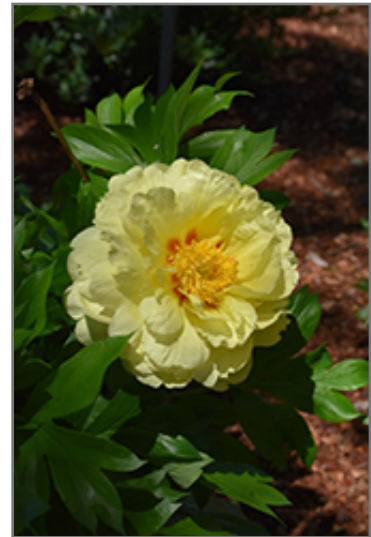
Bartzella Peony flowers