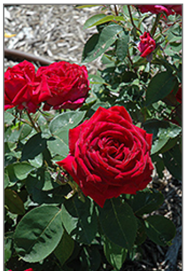
Kashmir Rose flowers

8785 Green Lake Trail Forest Lake, MN 55025 651-462-5554