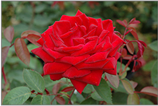
Kashmir Rose flowers

Kashmir Rose is recommended for the following landscape applications;