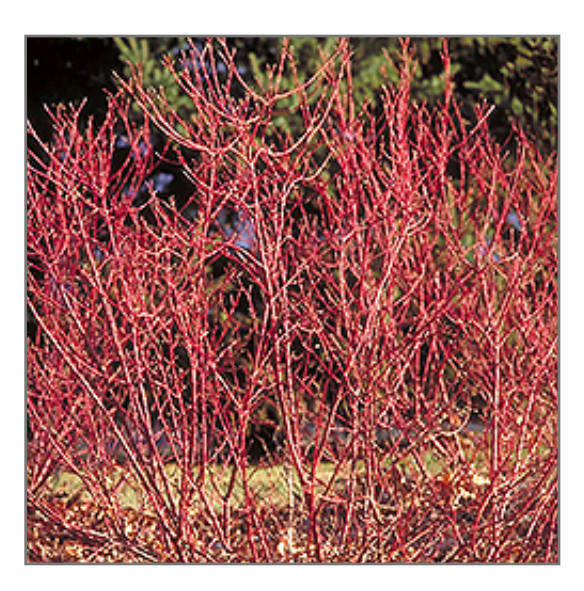
Isanti Dogwood in winter