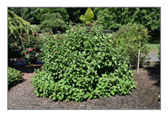
Isanti Dogwood

Isanti Dogwood is recommended for the following landscape applications;